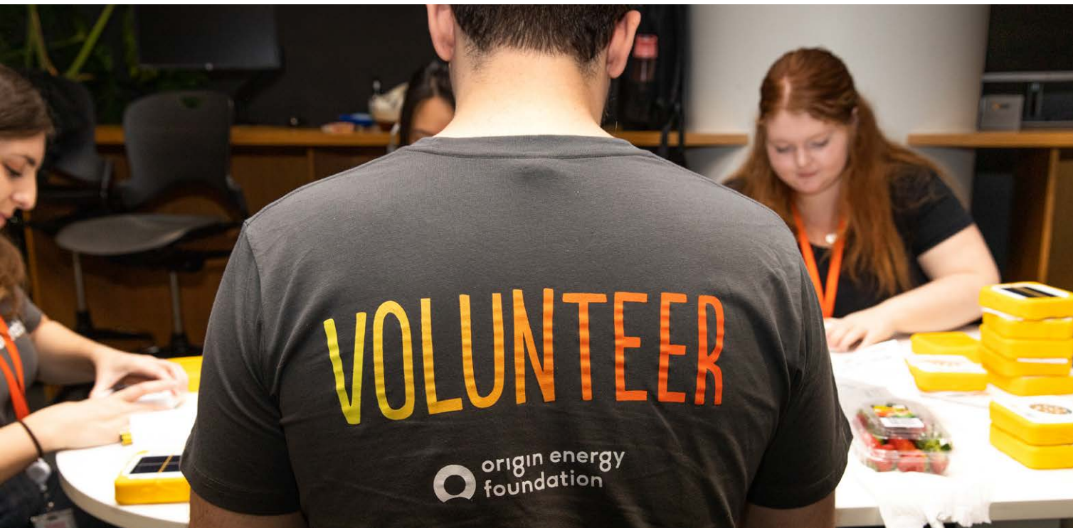
Origin Energy Foundation volunteer at SolarBuddy event.